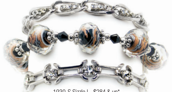
1930-S Sizzle I - $284 & up*

Our standard plate holds up to 3 bracelets.